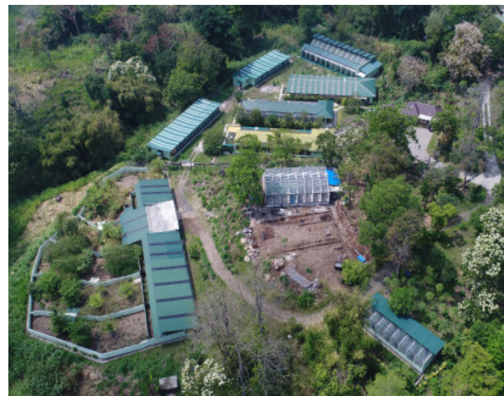
The Prigen Conservation Breeding Ark centre, Java, Indonesia.

In 2021, Shoal began discussions with the Prigen Conservation Breeding Ark (PCBA) in Indonesia. This ex situ conservation centre is run as a joint project by Taman Safari Indonesia, KASI Foundation, ZGAP and Vogelpark Marlow. PCBA is gaining a strong reputation for successful conservation breeding of rare Indonesian species. In 2021, PCBA began to expand the collection by adding insurance populations of fishes, particularly peat swamp fishes and Sulawesi endemic fish species. This perfectly matches Shoal 's priorities in Indonesia. We are delighted that PCBA is able to provide facilities for these species. Shoal will work further with PCBA to strengthen the collection where possible and link with them to support local partner in situ activities. PCBA currently has an active partnership with the Parosphromenus Project , the leading Shoal partner working on the conservation of this highly threatened genus of peat swamp fishes. Shoal is looking for partners to lead on the in situ conservation of other peatswamp fishes while PCBA takes the lead on the vital role of securing insurance of some of the threatened fishes in the world.