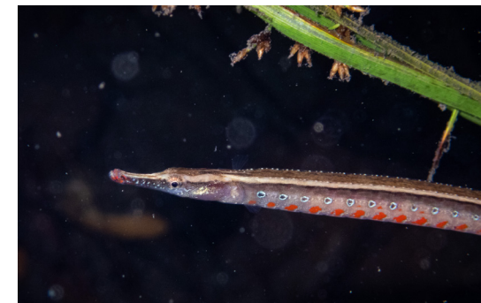
Dumbéa River pipefish

Each of the category winners of the art challenge had their work exhibited in the Oxford University Museum of Natural History during a three-day exhibition. Seeing their work displayed next to dinosaur skeletons in a room that contains the world's only surviving dodo soft tissue remains, under the watchful eye of a 19th century statue of the great Charles Darwin, put the Lost Fishes – and the artworks that had brought them to life – in a poignant perspective. Give these species a chance, or they'll go the way of the dinosaurs and the dodo.