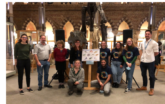
Lost Fishes Art Challenge exhibition at Oxford University Museum of Natural History