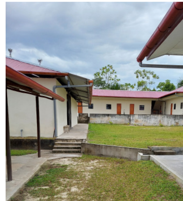
The Amazon Research Centre for Ornamental Fish, Iquitos, Peru.